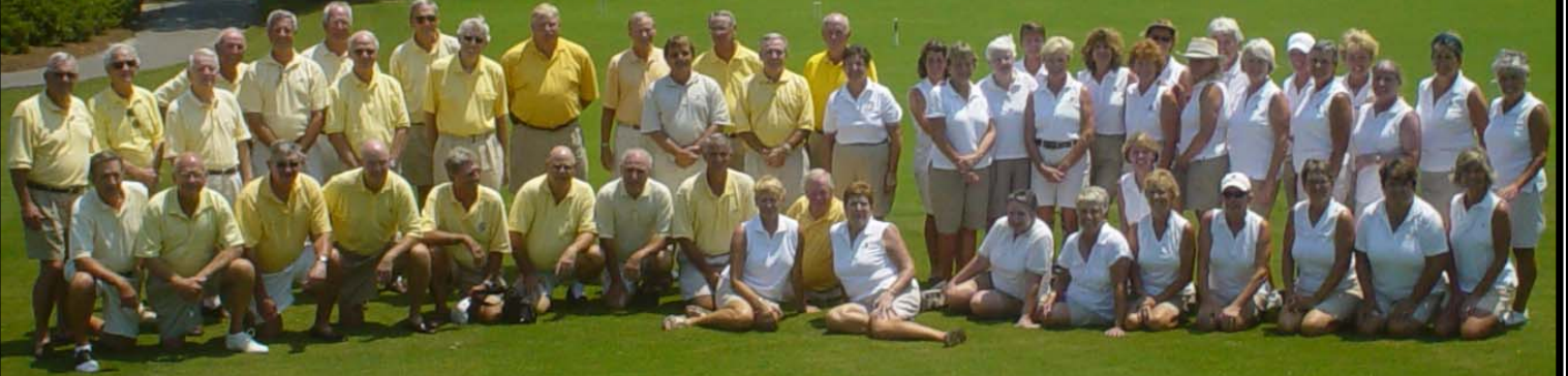
2008 Battle of The Reserve Participants